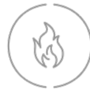
Passive Fire Protection

Proven track record in the toughest conditions from the cold harsh arctic conditions to warm tropical climates